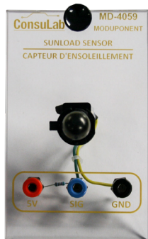
MD-4059 (53209) (SHOWN)

The ConsuLab MD-4000-24 is a versatile and adaptable electrical/electronic training series that allows students to build electronic circuits used in common HVAC systems.