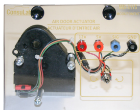
MD-4115 (53208) (SHOWN)